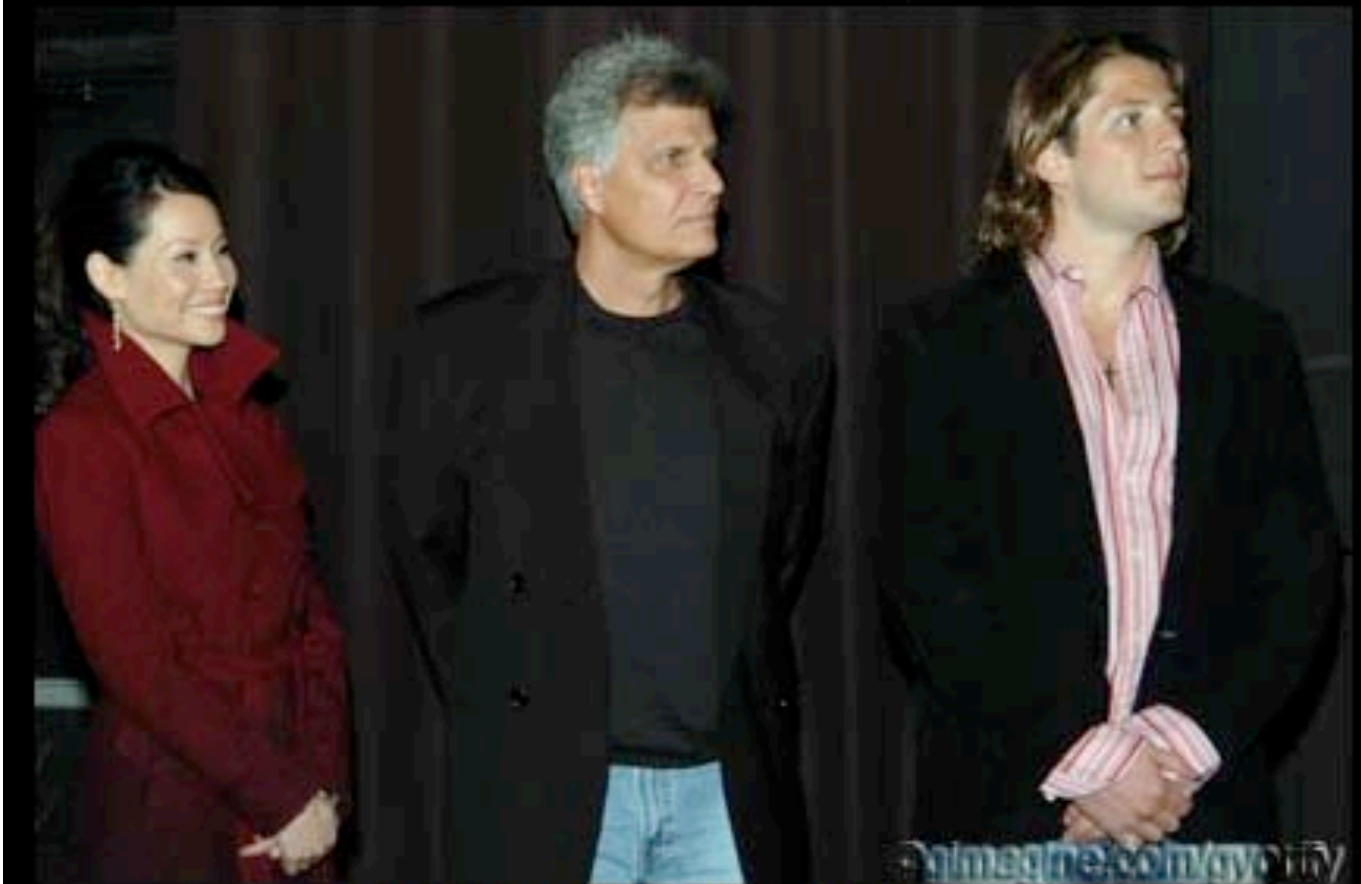
Lucy Liu, Mark Spitz and Tony Azevedo