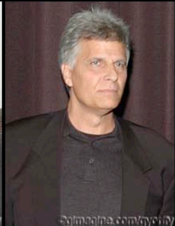
Ervin Zador and Mark Spitz